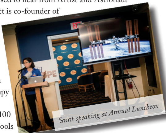
Stott speaking at Annual Luncheon

Attendees of Dial Hope's Annual Luncheon held on February 8, 2019 were blessed to hear from Artist and Astronaut Nicole Stott. Stott is co-founder of the Space For Art Foundation, whose mission is to spread hope through space exploration inspired art therapy programs with children in over 100 hospitals and schools around the world.